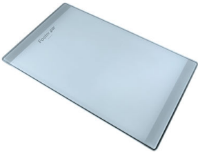
Glass chopping board