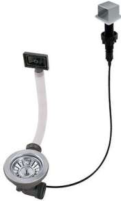
LIRA automatic waste fitting