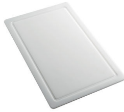
HPDE Chopping board