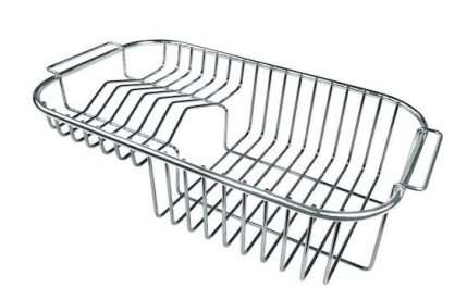
Stainless steel plate rack