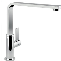
Mixer Tap NYC 8486 000