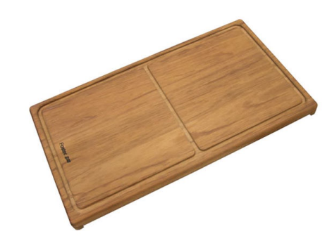
Iroko-wood sliding chopping board