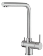
Mixer Tap Gamma 3 vie 8496 100