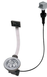
LIRA automatic waste fitting