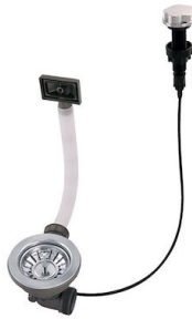
Automatic waste fitting