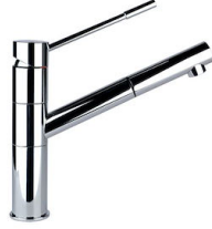
Mixer Tap Lorenzo