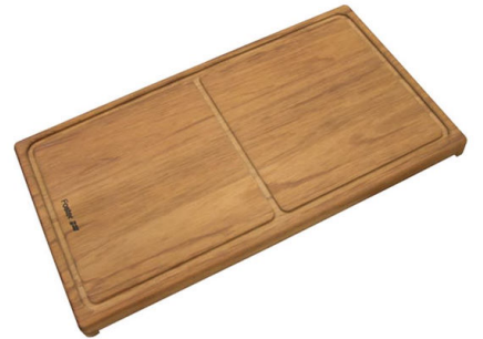
Iroko-wood sliding chopping board