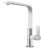
Mixer Tap NYC