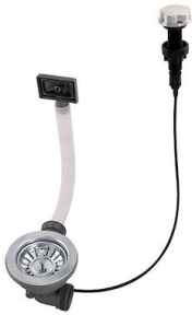
Automatic waste fitting