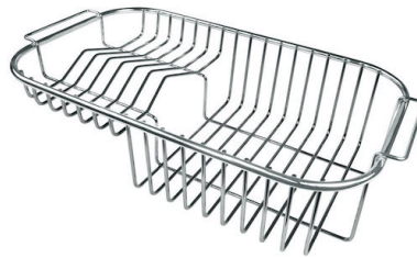
Stainless steel plate rack