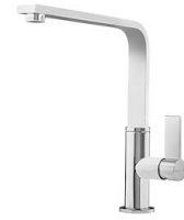
Mixer Tap NYC