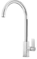
Mixer Tap Delta