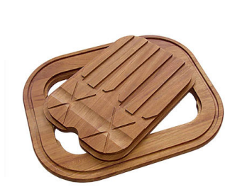
Iroko-wood twin chopping board 8644 003