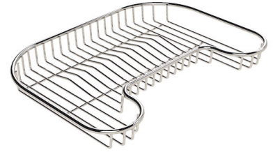
Stainless steel plate rack 8100 111