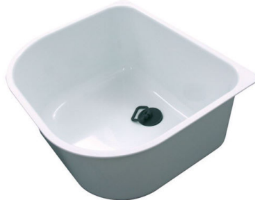
Vaschetta bianca 8152 100

* only in combination with the accessory 8644 003