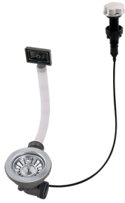
Automatic waste fitting 8407 000