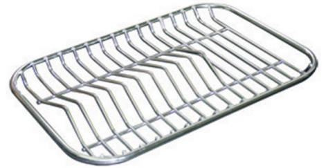
Stainless steel plate rack