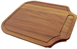
Iroko-wood chopping board