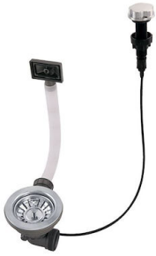
Automatic waste fitting