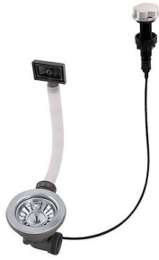
Automatic waste fitting