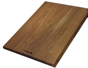
Iroko-wood sliding chopping board 8656 001