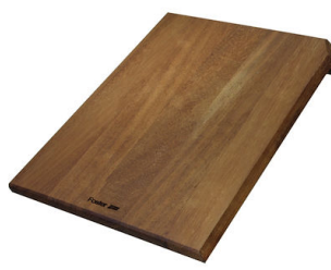
Iroko-wood sliding chopping board 8656 001