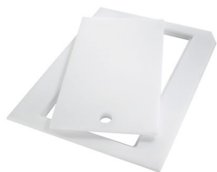
HPDE twin chopping board 8644 100