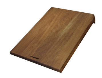
Iroko-wood sliding chopping board