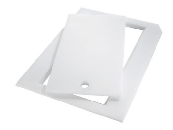
HPDE twin chopping board