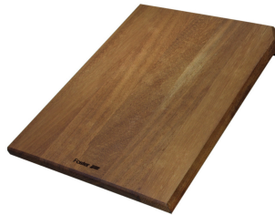
Iroko-wood sliding chopping board 8656 001