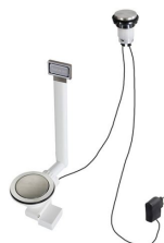
Space Light automatic waste fitting 8407 117