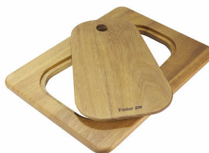
Iroko-wood sliding chopping board