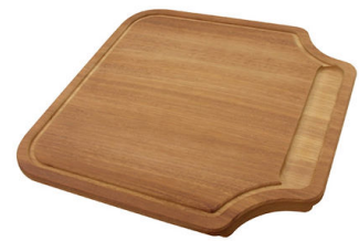
Iroko-wood chopping board