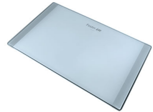
Glass chopping board