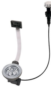
Automatic waste fitting