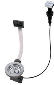
LIRA automatic waste fitting