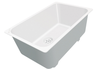
White bowl 8153 100