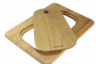
Iroko-wood sliding chopping board