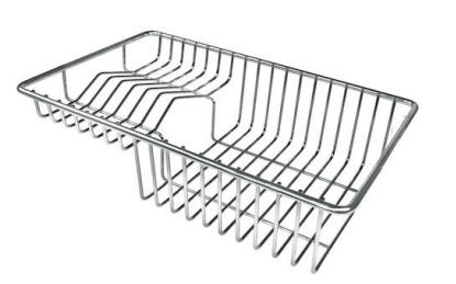
Stainless steel plate rack 8100 303 * only in combination with the accessory 8644 101