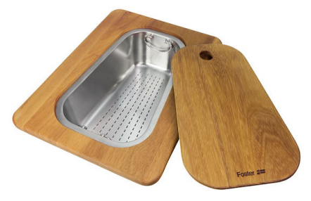
Iroko-wood chopping board with stainless steel colander