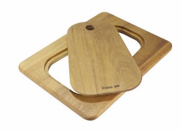
Iroko-wood sliding chopping board