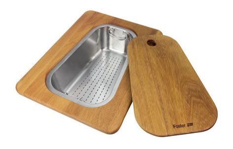
Iroko-wood chopping board with stainless steel colander