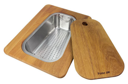
Iroko-wood chopping board with stainless steel colander