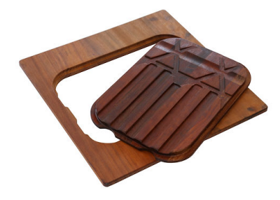
Iroko-wood twin chopping board