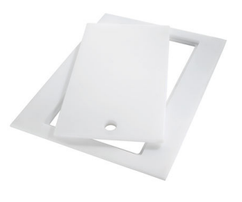
HPDE Twin chopping board