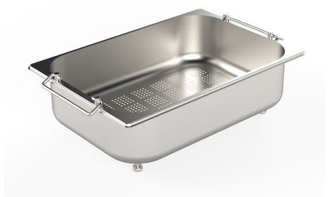
Stainless steel colander