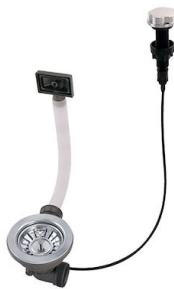
Automatic waste fitting