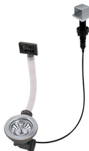
LIRA automatic waste fitting