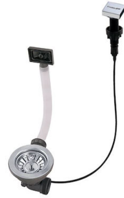
LIRA automatic waste fitting