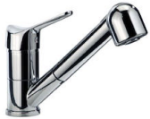
Mixer Tap S1000 - Z65 8449 500