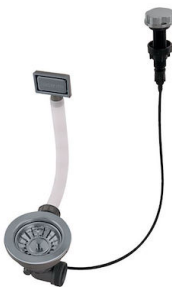
Gun Metal automatic waste fitting - PG 8407 110