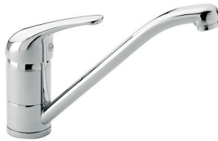
Mixer Tap S1000 - RO