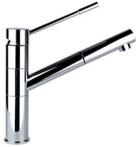
Mixer Tap Lorenzo