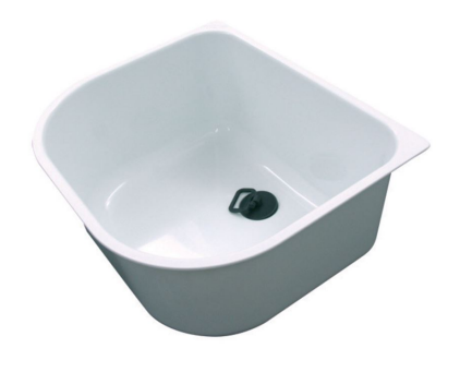
Vaschetta bianca 8152 100