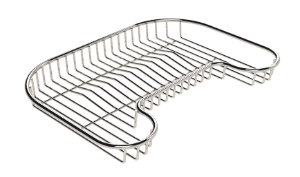
Stainless steel plate rack 8100 111