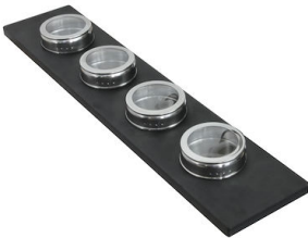
4 Spices-holder set 8100 620