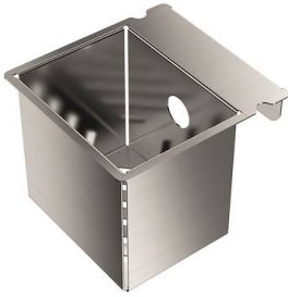
Stainless steel perforated tray 8151 001