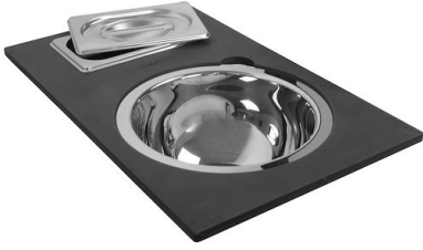
Kit multi-bowl 8100 628