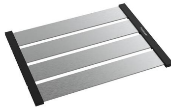
Foldable rack 8110 000