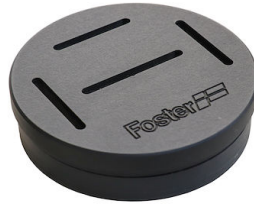
Knives-holder 8100 030 * only in combination with the accessory 8100 621