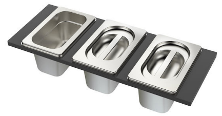
3 Bowls set 8100 622