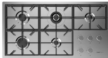
Cooker hob Foster Milano 7638 000