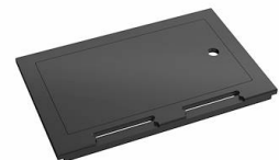
Kit Black 8100 037