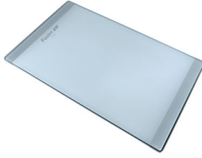
Glass chopping board