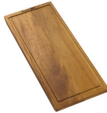
Walnut-wood chopping board