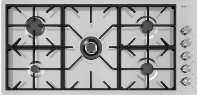
Cooker hob Foster Milano