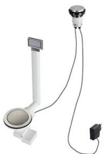
Space Light automatic waste fitting