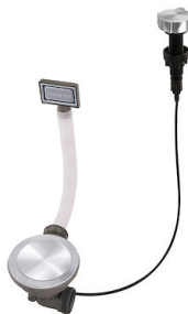
Space Milano automatic waste fitting