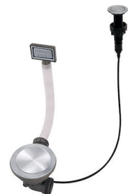
Space Push automatic waste fitting