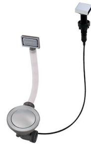
Space automatic waste fitting