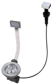
Automatic waste fitting