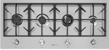
Cooker hob Foster Milano