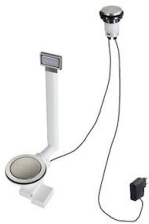
Space Light automatic waste fitting