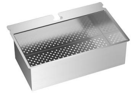
Stainless steel colander 8151 010