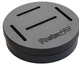
Knives-holder 8100 030 * only in combination with the accessory 8100 621