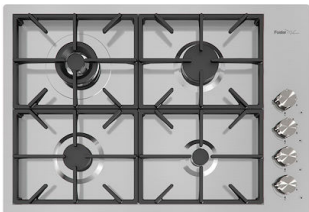
Cooker hob Foster Milano 7637 000