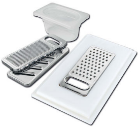
Grating kit complete with ring support and food collection tray