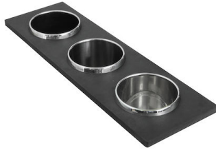
3 Bottles-holder set